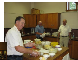
Some of the men helped serve/clean up!