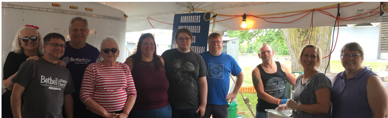
Members of Bethel and the community volunteering at the Prairie Days Burger stand in July.